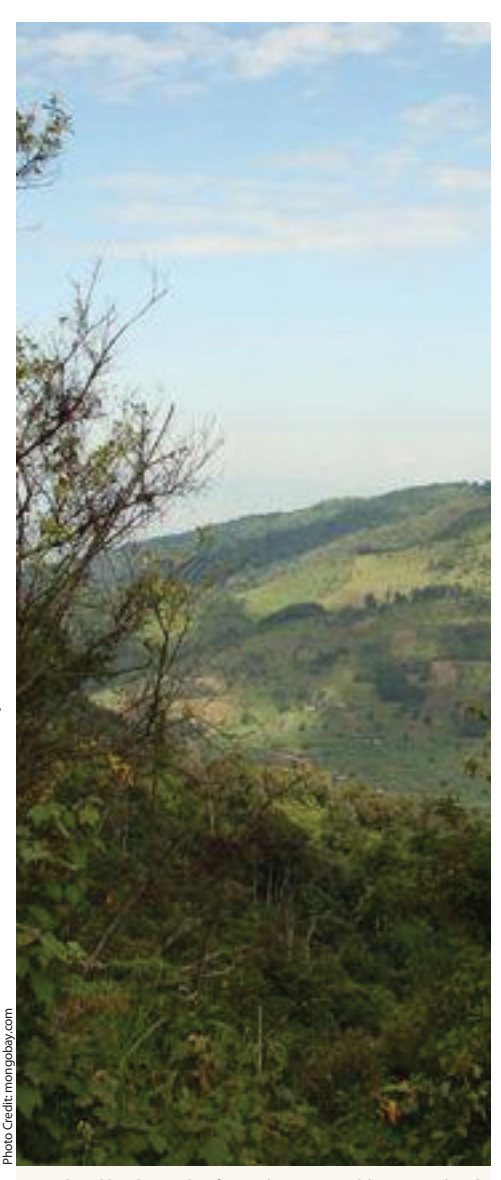
Agricultural land outside of Bwindi Impenetrable National Park, Uganda

On several occasions, the government of President Yoweri Museveni has sought to amend the Constitution and enabling legislation to expand the authority of compulsory land acquisition for economic development, investment and productive purposes. For example, in 2003, the government argued before the Constitutional Review Commission that extending the authority was necessary to promote the national economy, and that the provisions of Article 26